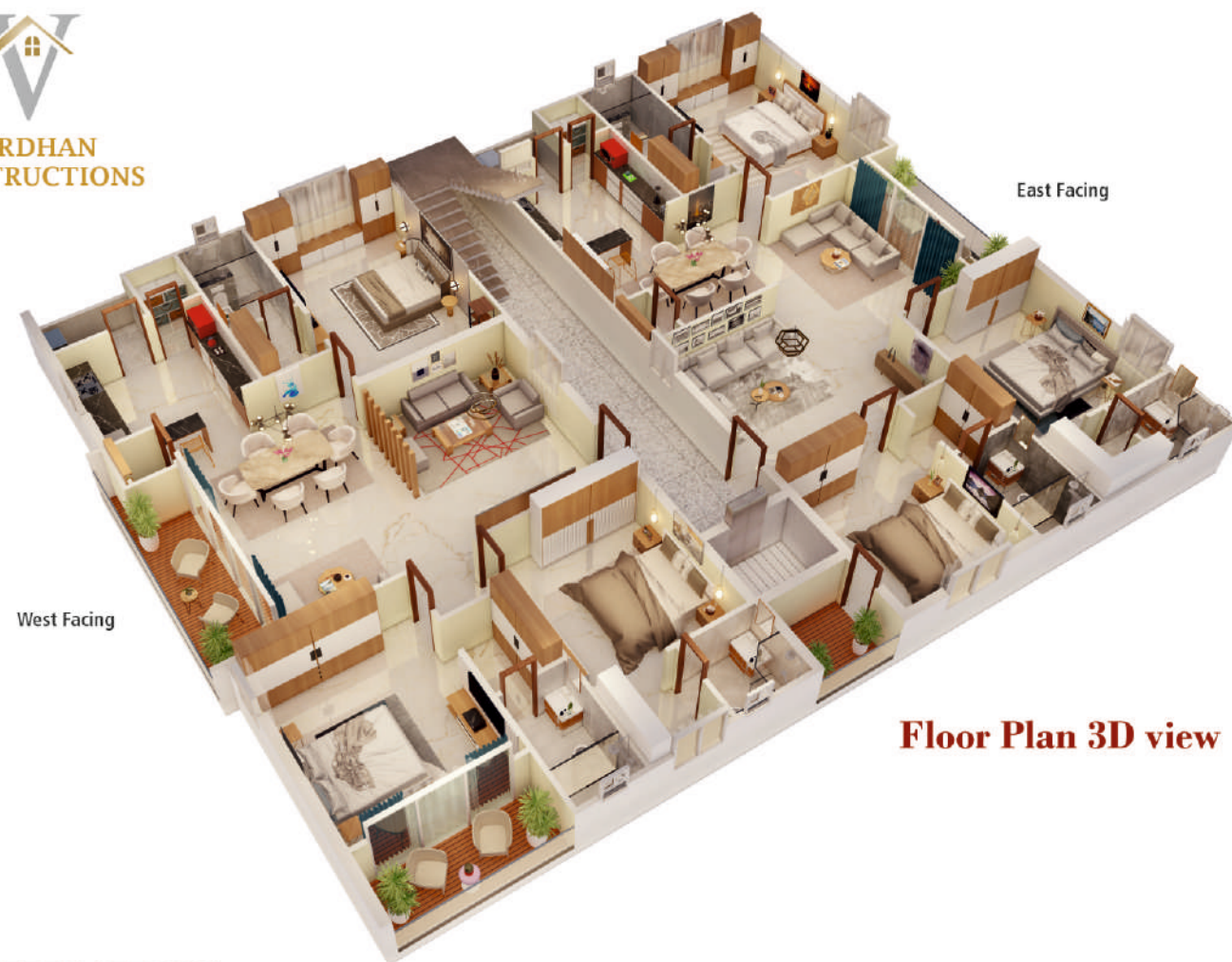
Floor Plan 3D view